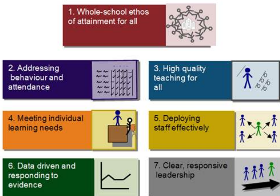
Figure 2: Building blocks for success

Based on interviews with senior leaders from more and less successful primary, secondary and special schools, the NFER research found that schools which are more successful in promoting high attainment have a number of things in common. It identified seven building blocks of success.