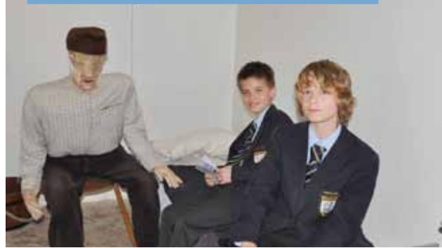
In 1779 John Howard, the prison reformer, condemned the old Bridewell as one of the vilest in the country; the present building was the first to be built to John Howard's recommendations and it became a prototype for new prisons both in England and America.