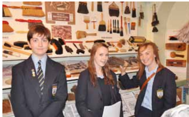
Wymondham was once renowned for brush making, an industry which lasted until the Briton Brush Company closed its factory in the early 1980s.