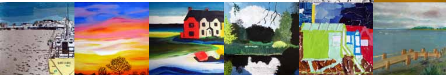
Above: a selection of Year 10 artwork (there will be more examples on the website after half term)